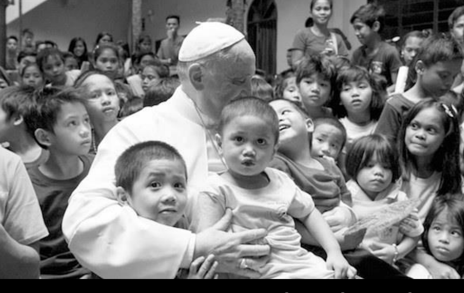
Give time to the lowly