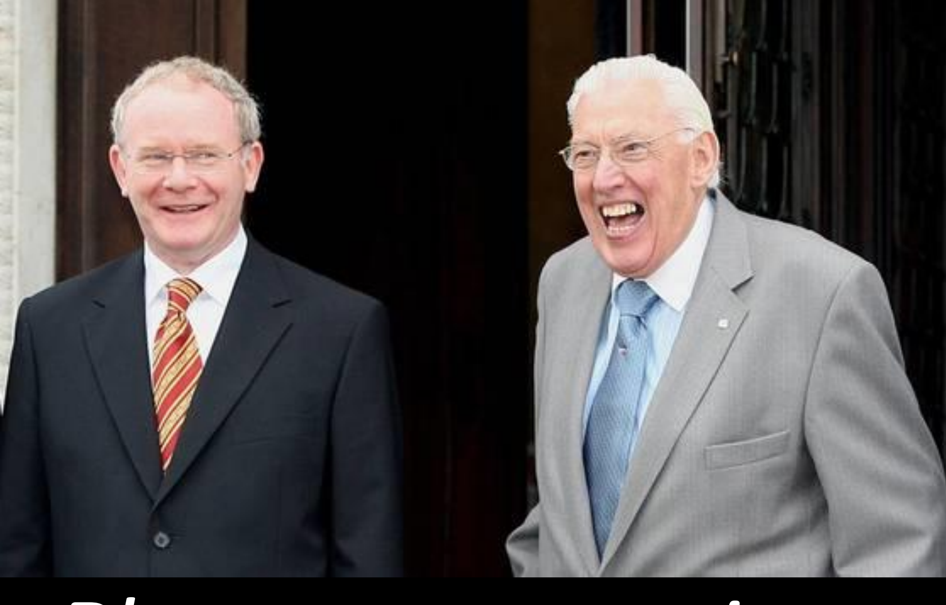
Bless your enemies