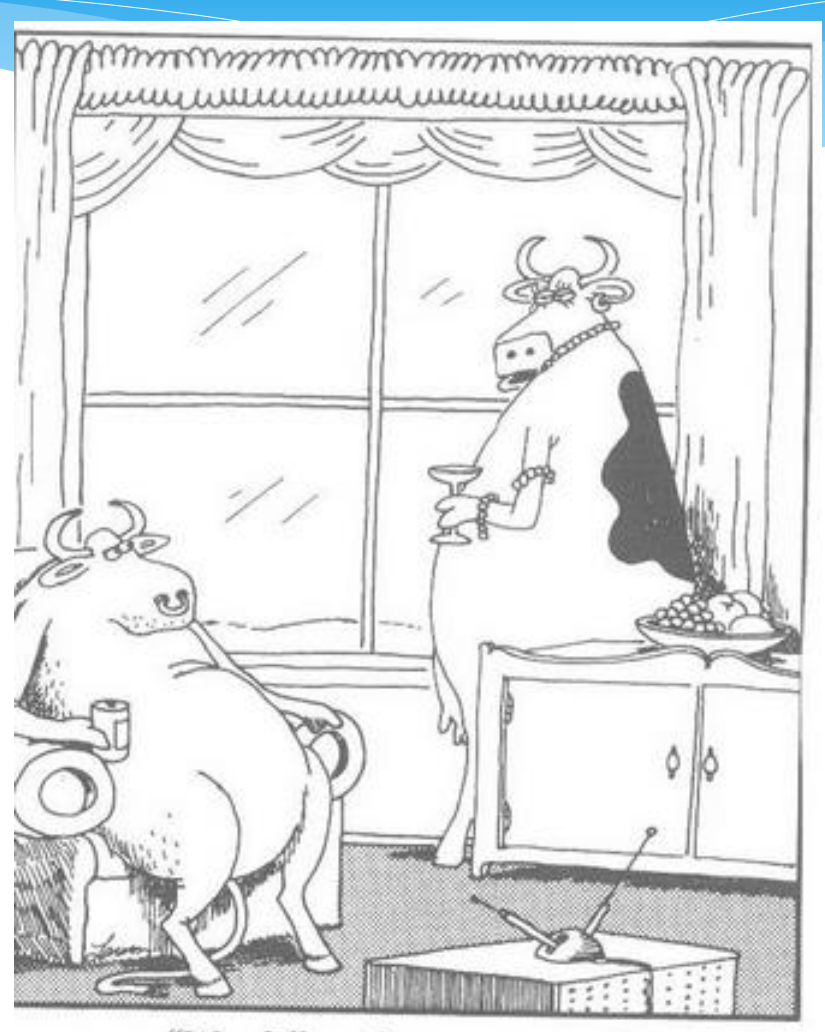
"Wendell ... I'm not content."